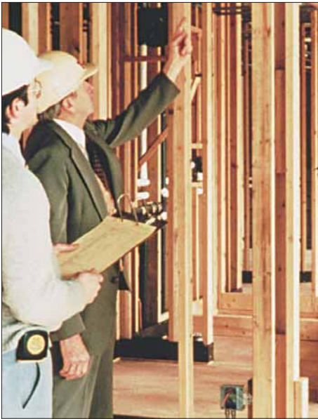
FirePRO® FRTW meets major model building codes.