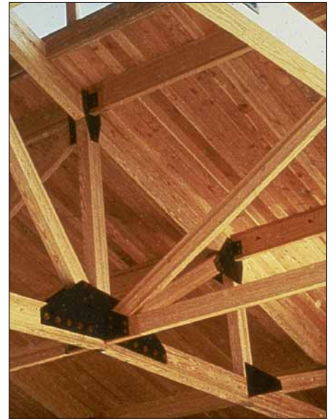
FirePRO® FRTW roof decking and trusses

The National Design Specifications (NDS), Wood Handbook, and other publications have cautioned against the use of any wood product in environments exceeding 150 degrees F (66 degrees C). Based on the strength data generated at the USDA Forest Products Laboratory, professional engineers have calculated design values and span adjustments to modify the untreated design